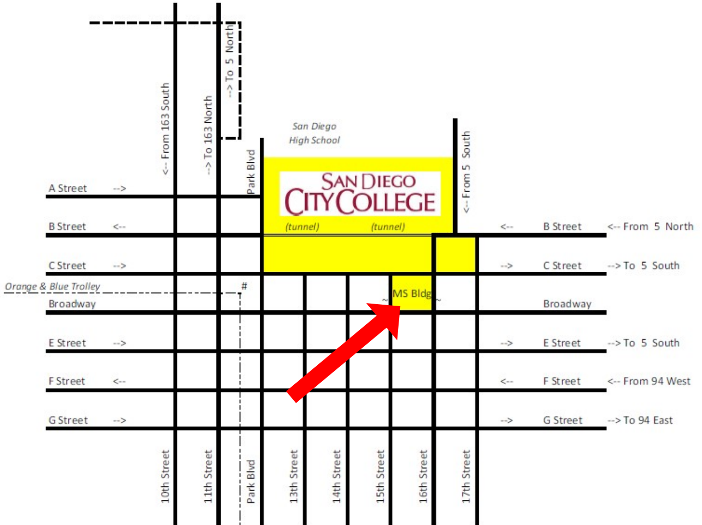
Close up of small highlighted square labeled “MS Bldg”.